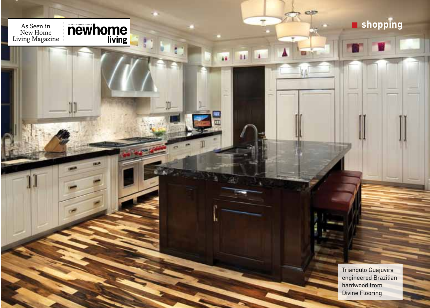
Triangulo Guajuvira engineered Brazilian hardwood from Divine Flooring