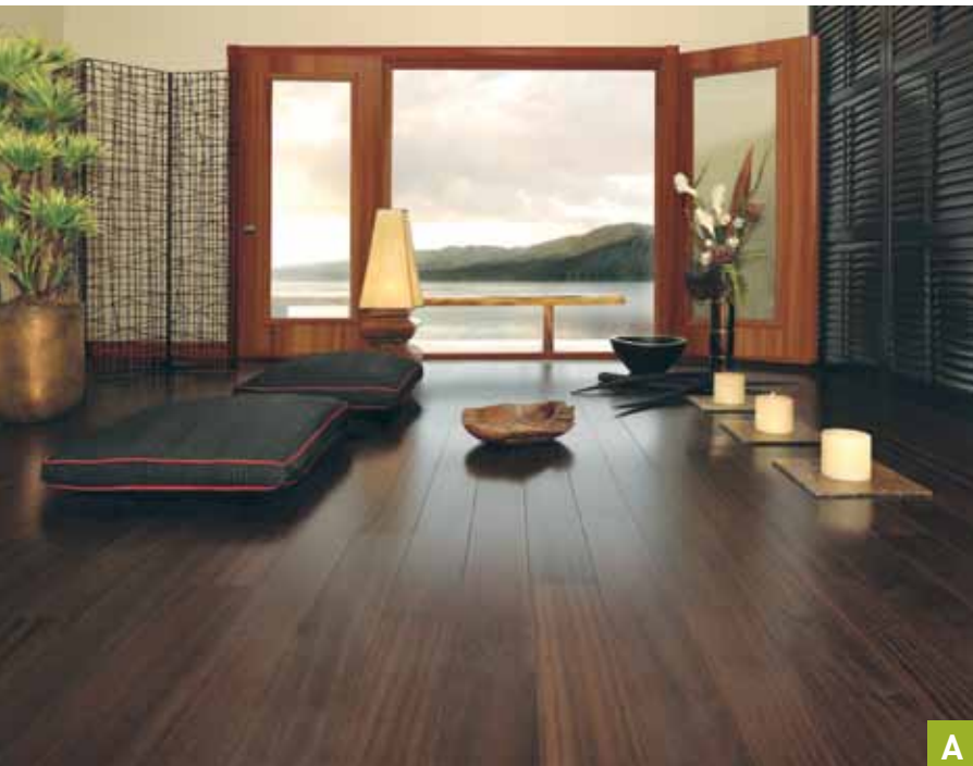
A HARO Engineered Beech Steamed Maritim from Divine Hardwood Flooring.